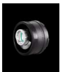
Type 2: 12mm orbital head