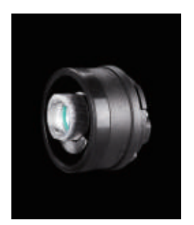
Type 1: 5mm orbital head