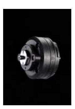
Type 4: High speed rotary head