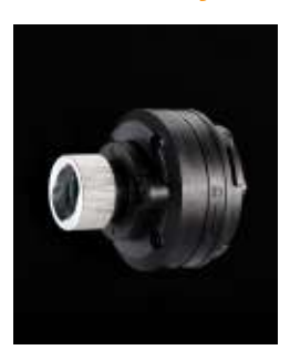
Type 3: High torque rotary head